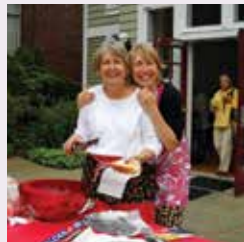
Story of the Year

Between July 1, 2015 and June 30, 2016, we will invest in our programming and community with planned expenditures of $657,408 in general operations, and an expected $48,596 in our allocated fund programs as follows: